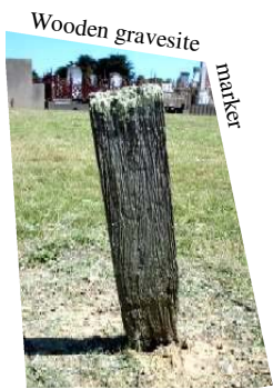
Wooden gravesite marker

bland. Of interest are the number of graves with wooden monuments, the lettering no longer readable. Many of the major pre-1900 Melbourne monumental masons are all represented at the cemetery including “A. A. Sleight”, “A. & G. Ballantyne”, “Marsh Grout & Co”, “J. Hanson” and “Corben”.