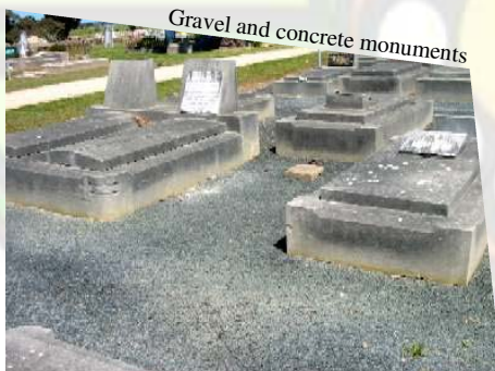
Gravel and concrete monuments

Why: Nestled in the corner of the racecourse and surrounded by farms, Bairnsdale Cemetery is a well maintained regional cemetery befitting the size of the locality. The earliest burials date from at least 1866. Though the cemetery is predominately lawn and monumental, what is striking are the changes to the denominational areas through the different eras. St Kilda Cemetery is pretty much uniform throughout with bricks paths and identical grave markers. This is not the case at Bairnsdale. In the centre monumental areas, one can see the novel use of gravel combined with in-built concrete grave markers for plots without a headstone monument. In the other monumental areas, there is evidence of wooden gravesite markers, though time has left them badly deteriorated. Mostly, metal markers are used throughout (two different designs were noted) making it unique for a country cemetery that so many of the graves are identifiable. Likewise for the denominational areas, each are well marked out with large but not overbearing signs. This suggests the cemetery is well cared for. Disappointing is the lack of prominent monuments to attract the eye of the welcome visitor. Instead, a majority of the monuments are of the post-1930 concrete style, uniform grey and