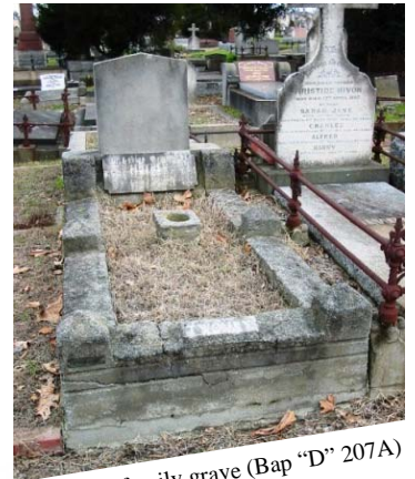
Twomey family grave (Bap "D" 207A)