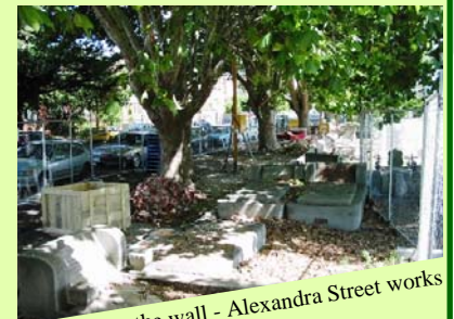
Rebuilding the wall - Alexandra Street works

The perimeter wall of the cemetery was in poor condition due in part to the invasion of the footings by the roots of the substantial Plane trees at the northern end of Alexandra Street. The City of Port Phillip has