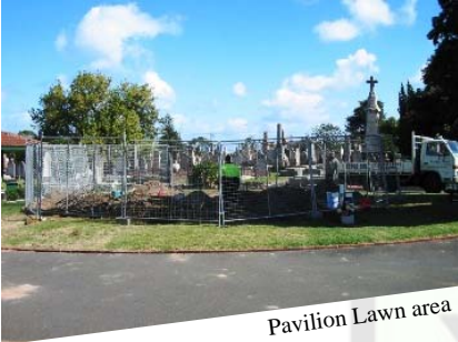
Pavilion Lawn area

Work is progressing at a steady pace by Lodge Bros. on the Stamoulis memorial within the new Pavilion Lawn area. When completed, the memorial is expected to add a new element to the character of the cemetery and rival some of the best monuments in Melbourne.