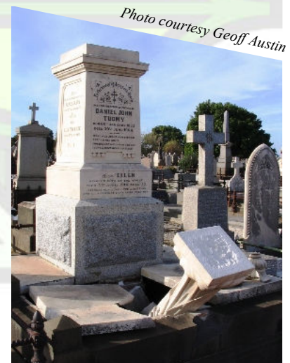
Toppled marble statue - Roman Catholic “A” compartment

Cemetery Conversations will be undergoing a redesign in the coming months to coincide with the launch of a new Friend’s website and fresh new logo. ☛