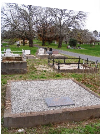
Carisbrook Cemetery with Aston grave in foreground