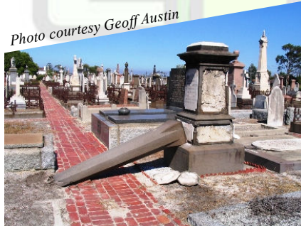
Toppled bluestone column - Wesleyan “B” compartment

Anyone wishing to check the names of the graves should contact The Necropolis on 8858 8204. ☛