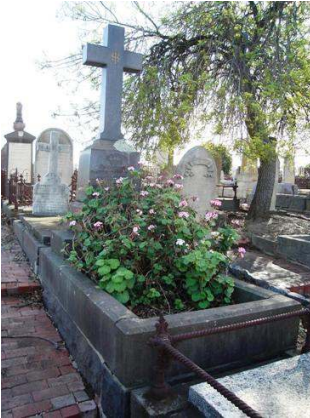
Grave of Sir Archibald Michie, one of the memorialists who signed the petition to close the St. Kilda General Cemetery (CofE "B" 15)

"The push to close the St. Kilda Cemetery reflected the social attitudes of the era that a cemetery positioned in a built-up area close to houses was prejudicial to their health".